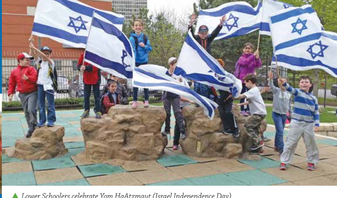
▲ Lower Schoolers celebrate Yom HaAtzmaut (Israel Independence Day).

when each student researches an organization to "adopt" during 8th grade. This research includes a field trip to several Chesed organizations in the Chicago area, meeting with Chesed professionals, and creating a strategy to promote their pet project. Students were excited to make phone calls, raise funds, set up collection boxes and get to work.